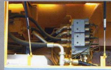
液压系统为高效节能的恒功率变量系统 The hydraulic system is constant output variable displacement system, high work efficient and energy saving.