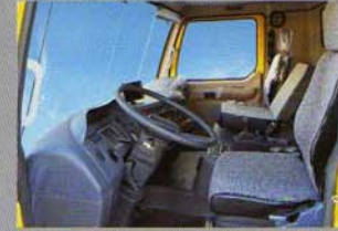
人性化的体贴设计,造型美观,具有良好的隔音效果 The ergonomically and considerate design, beautiful shape and with good soundproof effect.