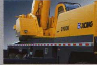
整体感更强,整车品质感更优越 The overall sense is stronger, and the overall quality is superior.