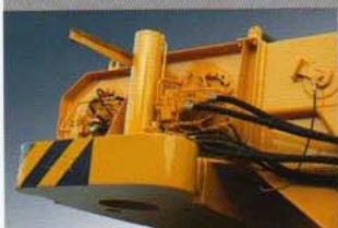
各种机构和控制系统的部件精确到每个匹配细节 Various mechanism and control system are accurate to every detail.