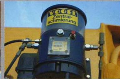
配有自动润滑装置 Centralized lubrication system