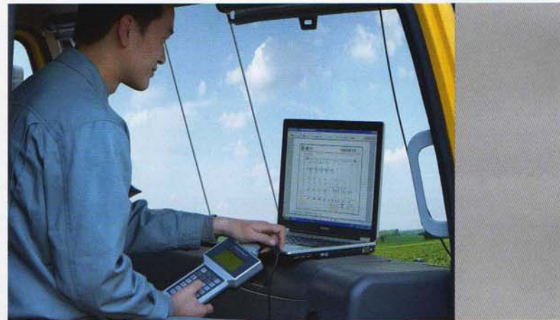
采用双功控模式的电控发动机,行驶时输出315kW功率,上车作业时仅输出180 kW The electronic-controlled injection engine with two operation control modes, 315kW output for crane travel drive and only 180 kW output for crane lifting operation.