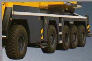
通过性能卓越的五轴底盘 The 5-axle crane carrier has excellent passability