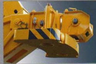
精巧的高悬式弧形配重 The smart and highly suspended arc type counterweight.