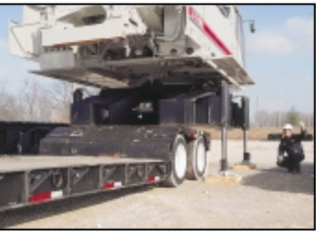
Hydraulic jacking system lifts the upper, lower frame and treadmembers off the ground. Treadmembers are removed and a trailer can then be backed under the lower frame and upper for transport.