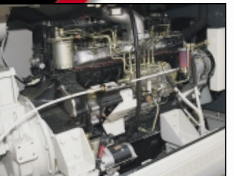
248 hp Isuzu A-6SD1T-QB-01 engine