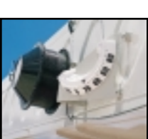
Mechanical boom angle indicator - standard